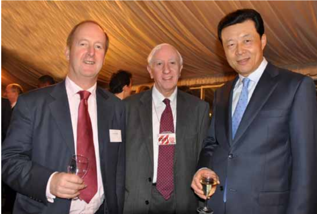
(L-R) The Rt Hon the Lord Northbrook, the Rt Hon the Lord Cotter and His Excellency Chinese Ambassador Liu Xiaoming

The Year of the Rabbit was celebrated in Parliament with China's Ambassador, His Excellency Liu Xiaoming, as the special guest of honour. Ambassador Liu made a toast to a happy new year and stronger bilateral ties between China and the Britain to the nearly 200 guests who were on hand for the Annual Terrace Reception organised by the All Party Parliamentary China Group (APPCG). The evening reception took place on the 1st of February and was hosted by the APPCG's Chairman the Hon. Mark Hendrick MP with the Minister of State the Hon. Jeremy Browne MP also as a special guest. The Minister spoke of the benefits of the 85,000 Chinese students studying in the United Kingdom and he expressed his hope that perhaps just as many British students could one day study in the People's Republic of China. Ambassador Liu added that such people to people contact should not be underestimated in strengthening ties between the two countries and that he would like to see educational exchanges grow stronger for years to come. He added it would be his hope for China's iconic pandas, or at least a pair of them, would be able to call Britain their home in the near future to reflect this bond.