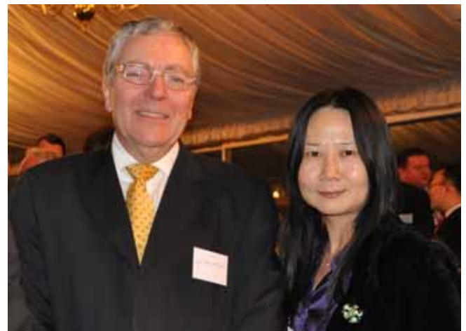
The Rt Hon the Lord Clement-Jones and guest